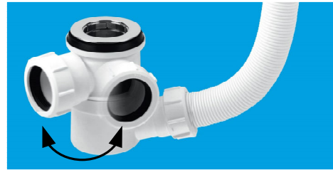
OUTLET CAN BE ROTATED