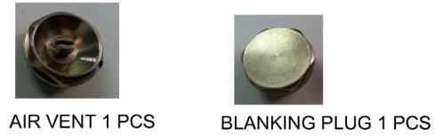
AIR VENT 1 PCS BLANKING PLUG 1 PCS