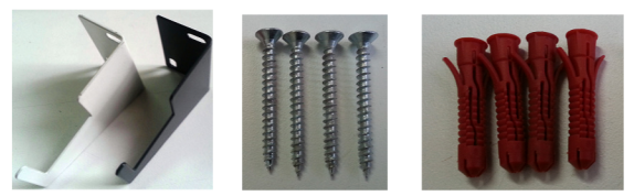
HANGER LEFT 2 PCS RIGHT 2 PCS SCREW 8 PCS WALL PLUG 8 PCS