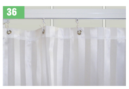
Fit your shower curtain to the hooks and gliders on the curtain rail.