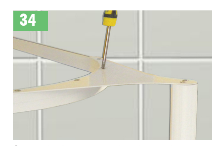
Screw the boomerang bracket to the curtain rail using the No6 x 3/4" countersunk screws. USE THE SCREWS PROVIDED.

Ensuring the post is straight, pilot drill through both the curtain rail and post using a 3.0mm drill. Screw both together with a No8 x 38mm pan head screw and cap.