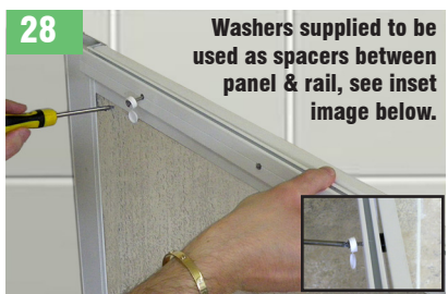
FULL HEIGHT FIXED PANEL:

If you need to extract the pin use a small flat ended screwdriver!