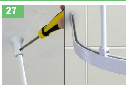
Secure drop rod into ceiling rose and rail connector into the top side of the curtain rail by tightening their respective fastening screws.