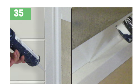
IMPORTANT: Seal all joints between compensators, walls, panels and shower tray or floor, on the inside and outside of the shower area using a waterproof, anti fungal silicone sealant.