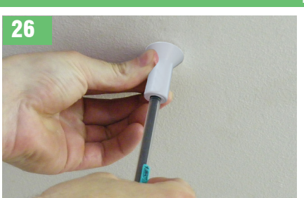
Mark position for the ceiling rose and fix to the ceiling using a suitable fixing (not supplied). Cut drop rod to length.