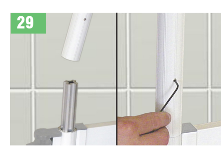
WHERE VERTICAL SUPPORT POLE IS

PRESENT: With the curtain rail in position, guide the post extension over the post spigot and secure in position with the supplied arubscrew.