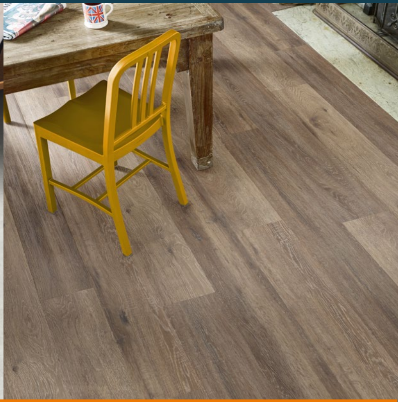
Baltic Mistral Oak ■ RKP8112