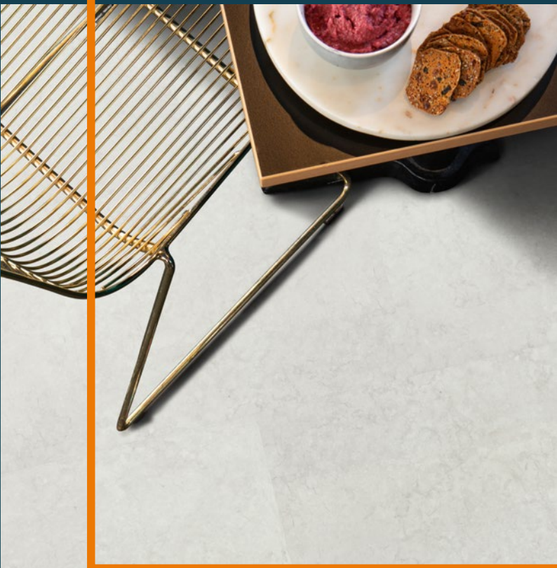
Tino ■ LLT208