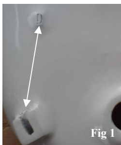
Foot location label C,D,E,F. 4 places

Lower the bath and ensure it sits level by screwing the adjustment screws in the feet. Fig 4. See diagram below.