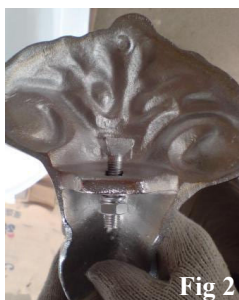
Foot bolt and retaining bracket. 4 places