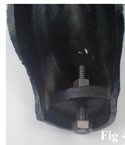
Foot adjustment screw. 4 places