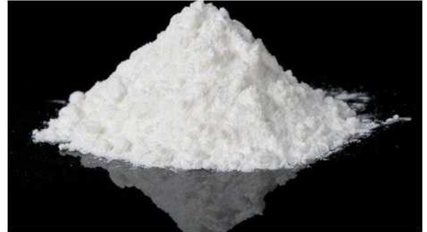
Natural mineral fillers