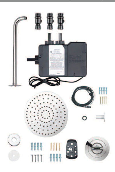
Components Adjustable (HP/Combi)