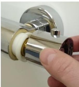
7. Once the Shower is set to the desired temperature, relocate the Temperature Handle onto the Cartridge spline, ensuring that the Over-ride Button Pin is against the Temperature Stop Lug. (This prevents the temperature from exceeding 38°C unless the Over-ride button is pressed)