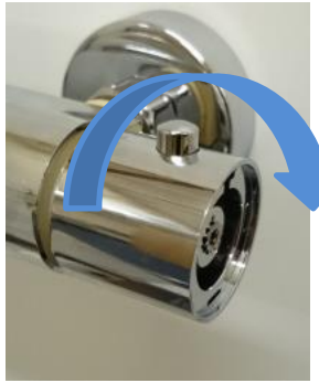
5. If the pre-set temperature is too hot, turn the handle towards the cold and wait approx. 10 seconds.