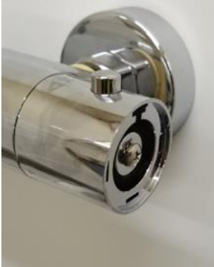
1. Remove the Temperature Handle Concealing Cap.

Note: The Temperature handle fixing method will slightly vary depending on type.