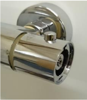
4. Relocate the Temperature Handle back onto the Cartridge Spline by approx. 3mm.