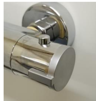
9. Re-fit the Temperature Handle Concealing Cap.