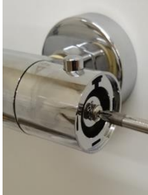
2. Using a X-head screwdriver remove the Temperature Handle.