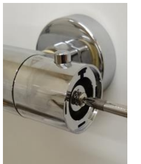
8. Again using a X-head screwdriver secure the Temperature Handle.