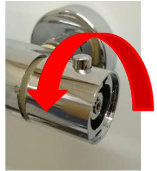
6. If the pre-set temperature is too cold, turn the handle towards the hot and wait approx. 10 seconds.