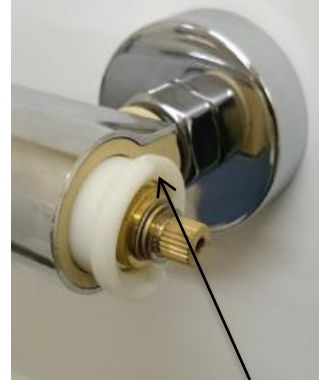
3. The Temperature Stop Lug and Cartridge Spline are now visible.